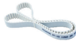
7 TIMING BELT : 1260 - 25 MM WIDE (PU JOINTED) Ref : AARZ-01274