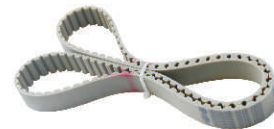
9 TIMING BELT : 1210 - 25 MM WIDE (PU JOINTED) Ref : AARZ-01273