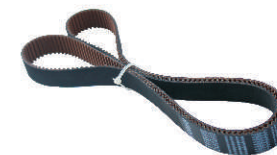
10 TIMING BELT : 1420 S5M - 25MM WIDE Ref : AARZ-01281