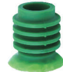
3 VACUUM EXHAUSTER Ref : APXD-01033