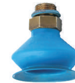
4 SUCTION CUP Ref : APXD-01035